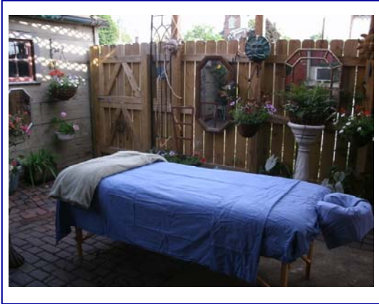
Outdoor massage on our patio